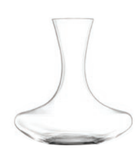
BLISS DECANTER (L)

4GB01G0013 Capacity 750 ml. Height 219.00 mm. Packing 1/6 CBM 0.079