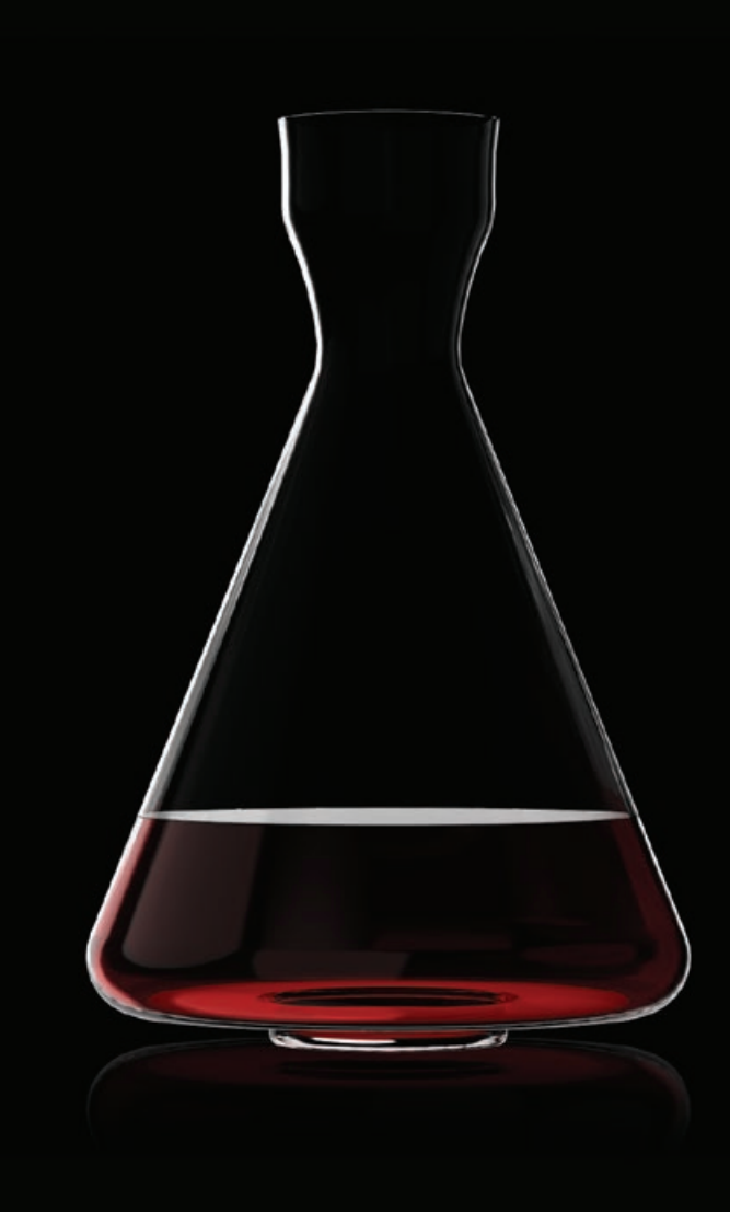
DECANTERS & CARAFES