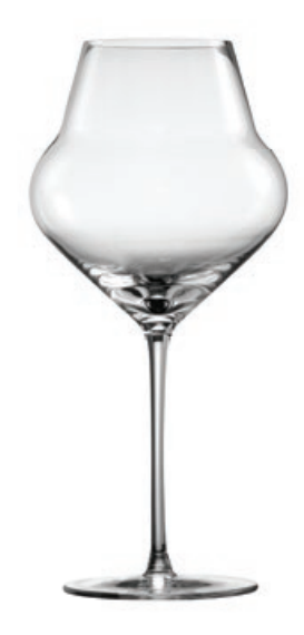
AIR LS15AR26 Capacity 730 ml. 25 1/2 UK oz. 24 3/4 US oz. Height 255 mm. Packing 6/24 CBM 0.117