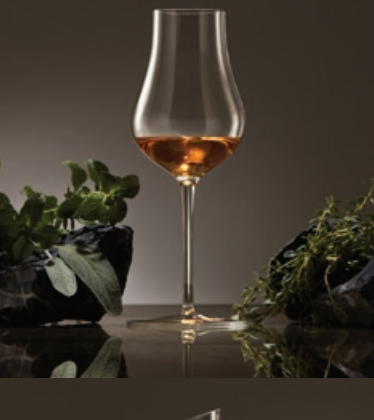
CLASSIC Perfect Balance

A classically styled stemmed and tulip shaped glass designed for balanced whiskies, and well suited for any high-end whisky venue.