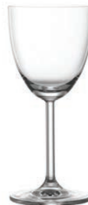
LS12NRO6 NICK & NORA Capacity 175 ml TD 70 mm FD 65 mm MD 70 mm H 168 mm CBM 0.031