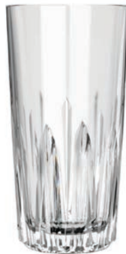
LP23HB12 DAZZLE HI BALL Capacity 350 ml TD 73 mm BD 61 mm MD 73 mm H 145 mm CBM 0.025