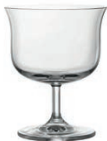
LS12LTO9 LOTUS Capacity 270 ml. TD 91 mm FD 69 mm MD 91 mm H 112 mm CBM 0.034