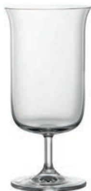
LS12DC12 DECO Capacity 340 ml. TD 77 mm FD 69 mm MD 77 mm H 160 mm CBM 0.034