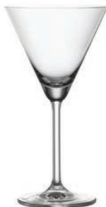
LS12MNO6 MARTINI Capacity 160 ml TD 87 mm FD 69 mm MD 87 mm H 173 mm CBM 0.048