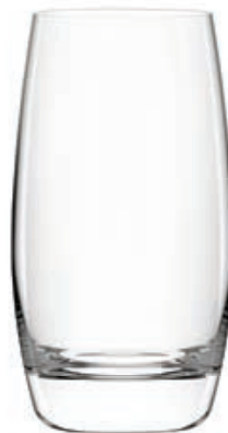
LT16HB10 HI BALL Capacity 285 ml TD 53 mm BD 37.5 mm MD 66 mm H 123 mm CBM 0.020