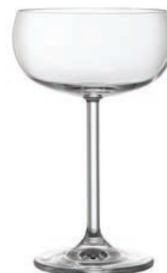
LS12SCO7 SAUCER Capacity 205 ml TD 90 mm FD 69 mm MD 95 mm H 133 mm CBM 0.041