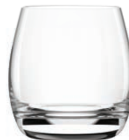
LT16DR13 DOUBLE ROCK Capacity 370 ml TD 70 mm BD 50 mm MD 88 mm H 92 mm CBM 0.025