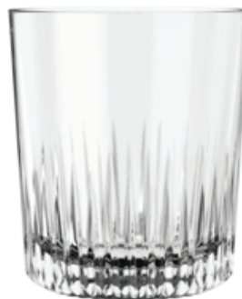
LP24DR12 GLEAM DOUBLE ROCK Capacity 350 ml TD 85 mm BD 74 mm MD 85 mm H 99 mm CBM 0.024