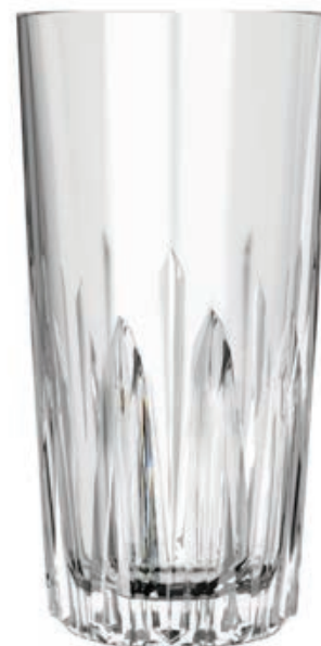
LP23LD15 DAZZLE LONG DRINK Capacity 430 ml TD 77 mm BD 50 mm MD 77 mm H 155 mm CBM 0.030